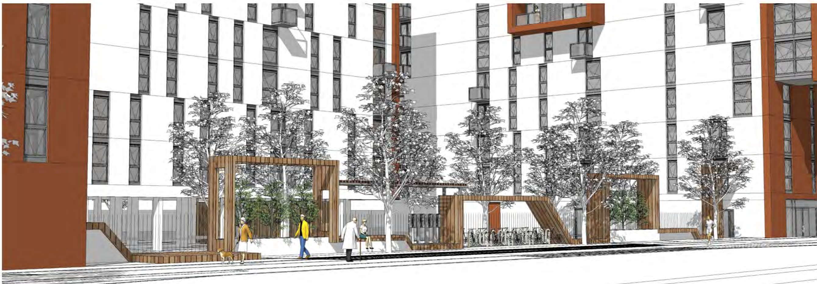
Victoria Avenue Fence Perspective